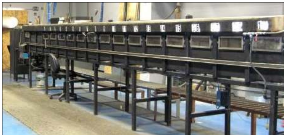
Figure 1: Steiner tunnel used for plenum cables conformance tests (NFPA 262)