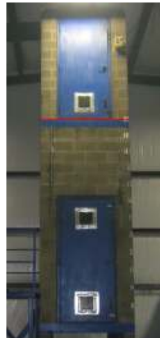
Figure 2: Riser Shaft (UL 1666)

Optical cables do not need to comply with as many additional requirements because they transmit photons (light), unlike electrons (electricity). Photons do not constitute a direct danger to humans because there is no risk of electric shock.