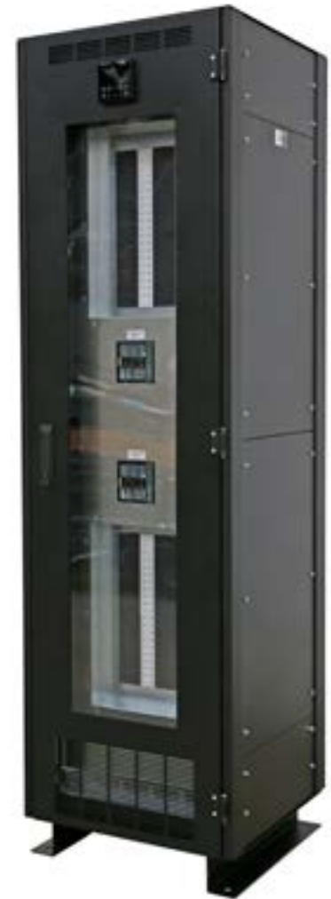
Optional polycarbonate viewing window shown

These RPPs are ideal for any load distribution scenario with systems ranging from 42-circuits with no monitoring all the way to 168-circuits with revenue grade monitoring on each circuit.