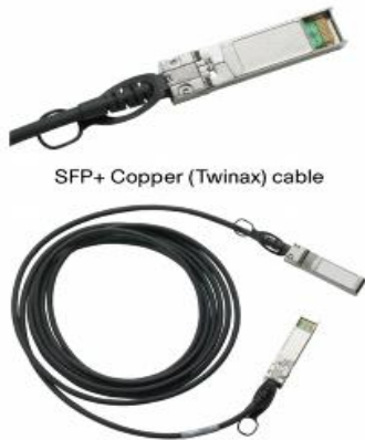
SFP+ Copper (Twinax) cable

In the past two years an unprecedented innovation occurred. Instead of connecting two SFP+ interfaces together using optics, a direct way of connecting without optical interfaces was created, using cables with ends built to behave as SFP+ optical modules. Instead of installing an optical transceiver at each end plus a length of fiber optic cable, a cable was invented with each end physically resembling an SFP+ transceiver, but with none of the expensive electronic components. A small component is required to identify cable type to the SFP+ host, but its cost is negligible. This innovation, called either Direct Attach Cable (DAC) or twinax, is a low cost solution for shorter distances, while keeping the high-density equivalent to RJ45 connectors.