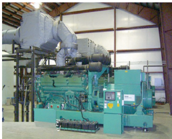
Figure 4. SCR units (insulated in gray) can take up a considerable amount of space.

In addition, some aftertreatment devices can add a significant amount of backpressure, requiring precise, duty-cycle-based control of temperatures and dosing frequency for regeneration. Such devices also represent an additional item to be serviced. Finally, most NOx aftertreatment devices reduce emissions when operating at high temperatures, but such temperatures may not even be reached by an emergency standby generator that is lightly loaded.